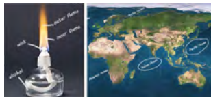
Image roaming drag Region zoom in

Show content beyond the display window, roaming dragging and also region zoom in, making teaching easily